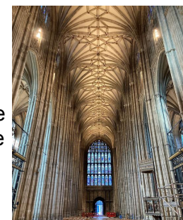
Image of the recently restored vaulted ceiling of the Nave and the Great West Window. Testament to our amazing stonemasons and glaziers!