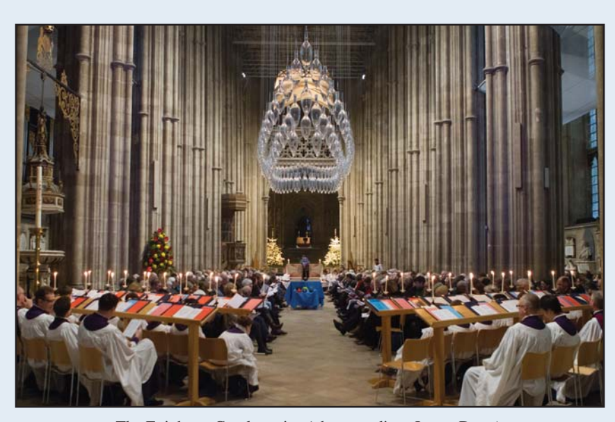
The Epiphany Carol service

Thank you for your support of all we continue to do and for the interest The Friends of Canterbury Cathedral in the United States take in our work.