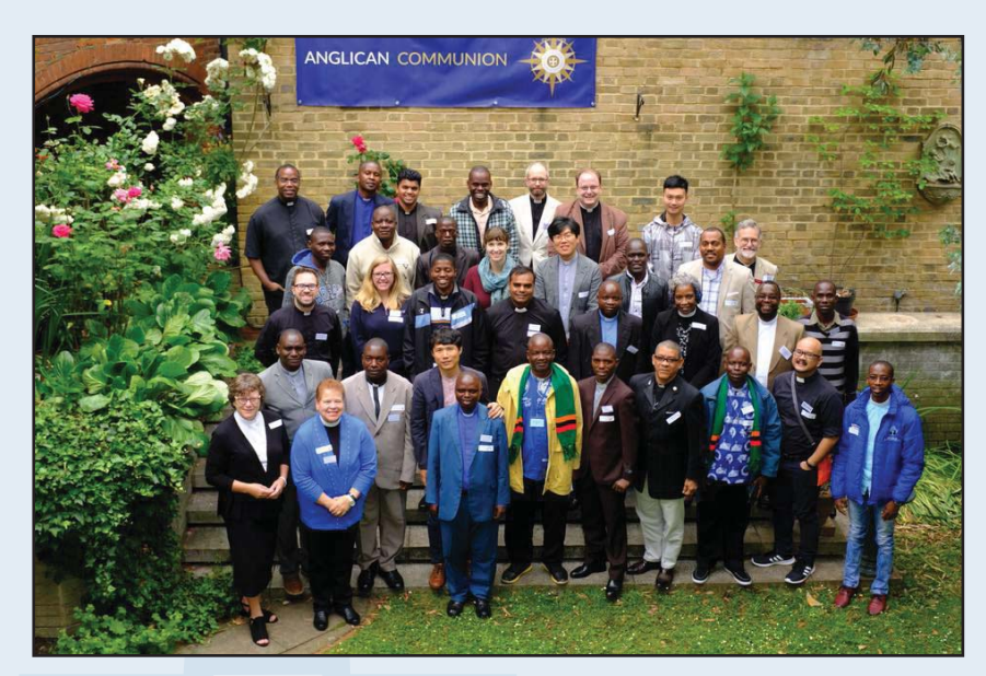
2018 Canterbury Scholars Programme