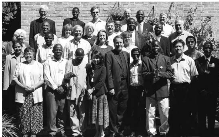
Canterbury Scholars Class of 2006

Signed by twenty-eight students from eleven countries: Brazil, Canada, India, Mauritius, South Korea, Sri Lanka, Sudan, Tanzania, Uganda, the United States, and Zambia.